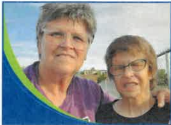
INSIDE THIS ISSUE: Volunteer Enjoys Blossoming Friendship

Non Profit Organization U.S. Postage PAID Rapid City, SD Permit No. 618